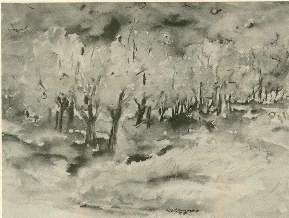
Joel C. Moss "Autumn Landscape" Collection of Department of Art, FHSU