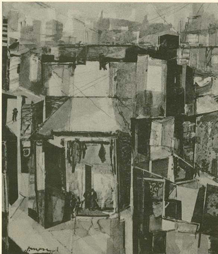
Joel C. Moss "Village Market" Collection of Department of Art, FHSU