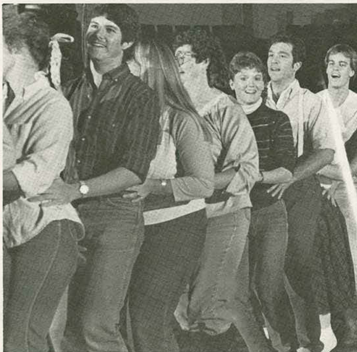
FALLING IN LINE - behind Sheridan are students, alumni, faculty, staff and friends of Fort Hays at a Sock Hop held in Sheridan to help raise money for the needed renovation. The Residence Hall Association sponsored the evening.