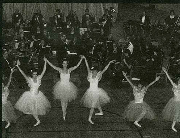
The above photo as well as the one at the bottom of this page reflect but two of the many activities held in the Coliseum in the past.

Established in 1902 to educate teachers for the rapidly developing High Plains of Western Kansas, Fort Hays State University began operations in an old, abandoned military post known as Fort Hays. During the University's first year, 19 students and two instructors comprised the student body and faculty.