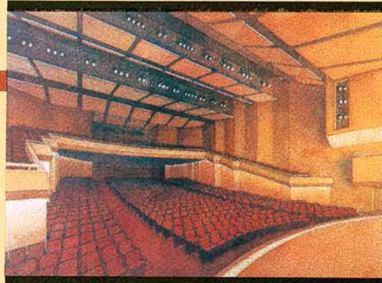
Shown on this page are two artist's concepts of the new auditorium in the renovated Coliseum, along with the floorplans.

The New Performing Arts/Student Services Center