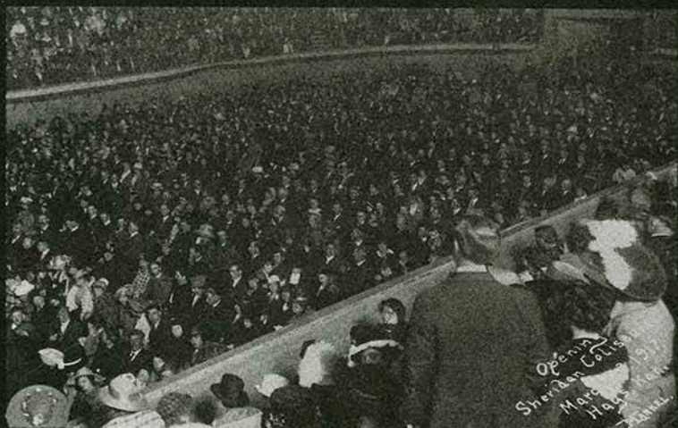
A view of the capacity crowd attending "Il Trovatore" — the first Grand Opera ever presented in Western Kansas — which was hosted on Sheridan Coliseum's opening night, March 23, 1917.