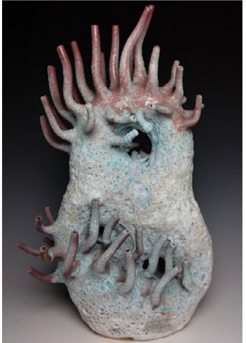
Alium Digitum Dimensions (14" x 8" x 5") Stoneware and Glaze