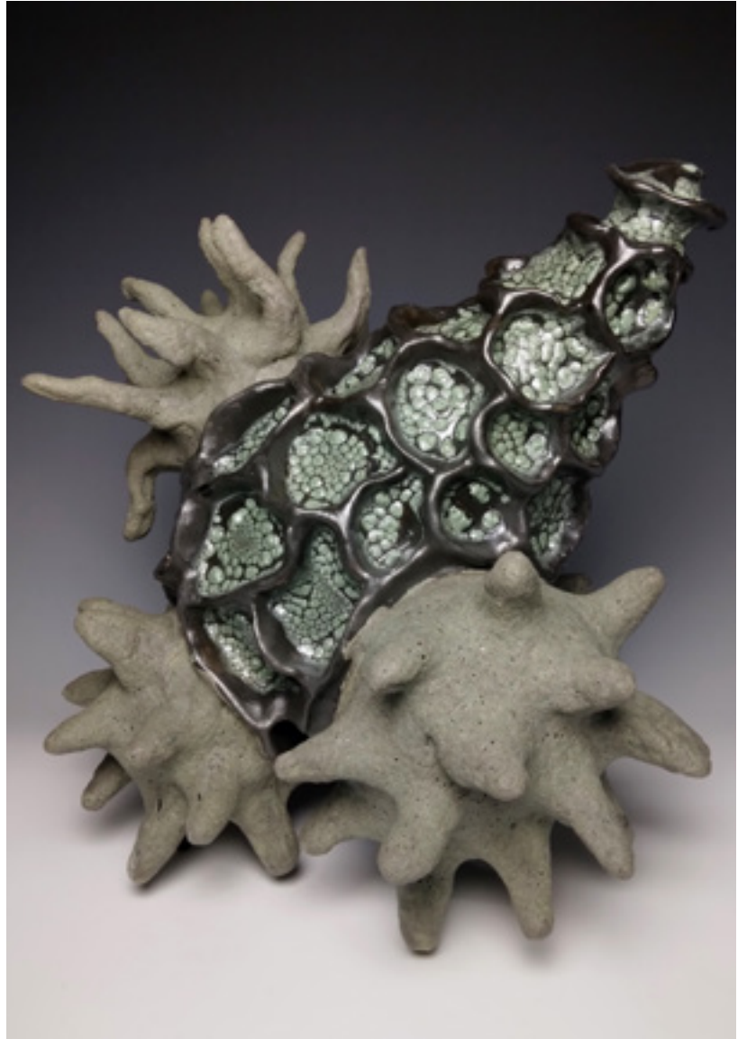
Ascidian Tunicate Dimensions (11" x 12" x 11") Stoneware and Glaze