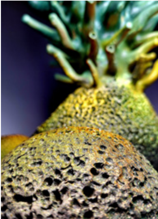
Crescens De Petra Dimensions (22" x 17" x 16") Stoneware, Glaze, Glass, Paint