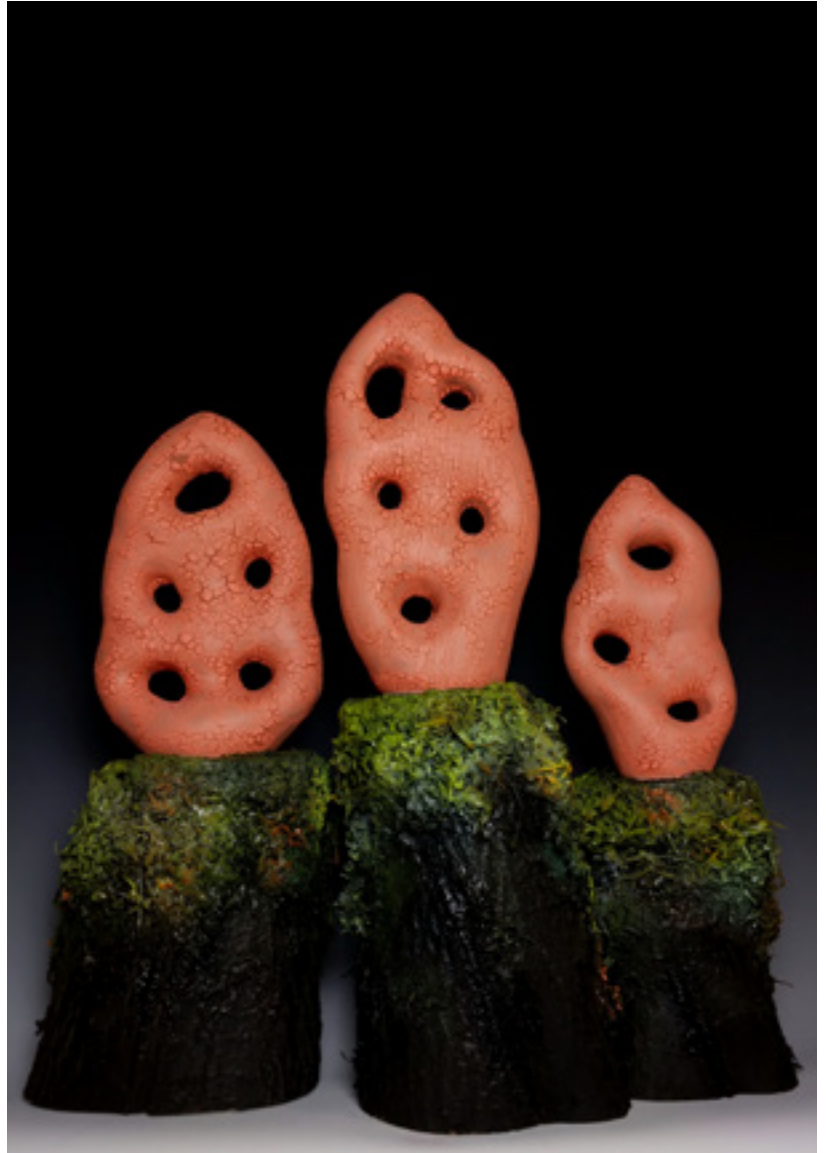
Aurantius Fungi Dimensions (16" x 18" x 8") Clay, Glaze, Wood, Mixed Media