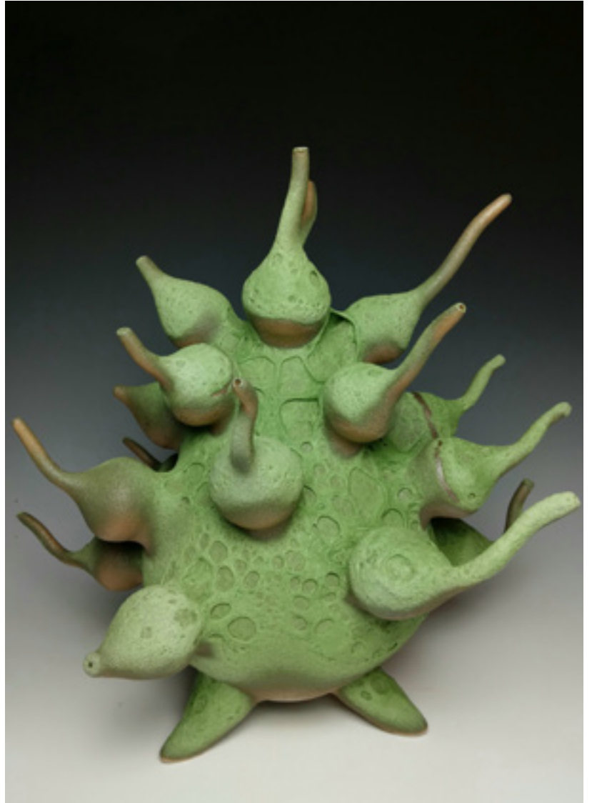
Digitus Pirum Dimensions (14" x 13" x 13") Stoneware and Glaze