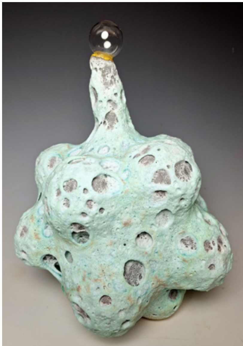
Globus Molaris Dimensions (12" x 9" x 9") Stoneware, Glaze, Glass, Paint