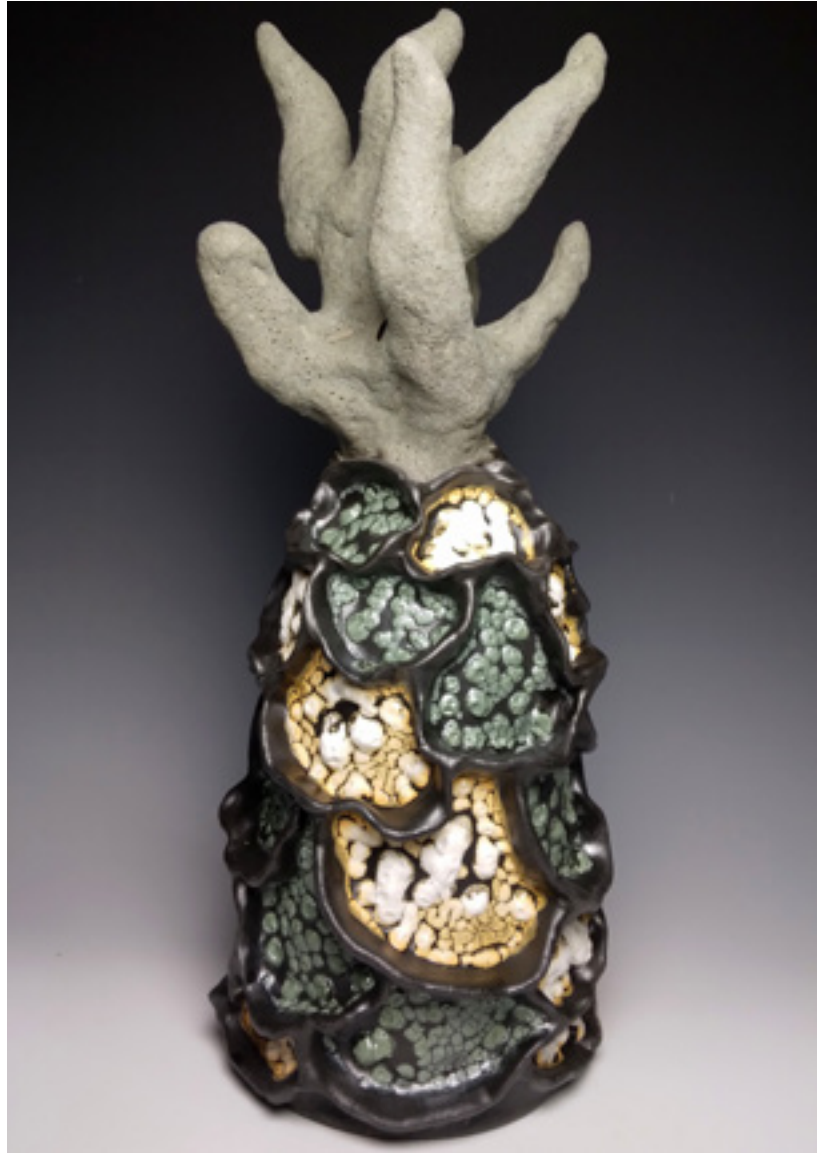
Inferioribus Intelligentia Dimensions (16" x 8" x 8") Stoneware and Glaze