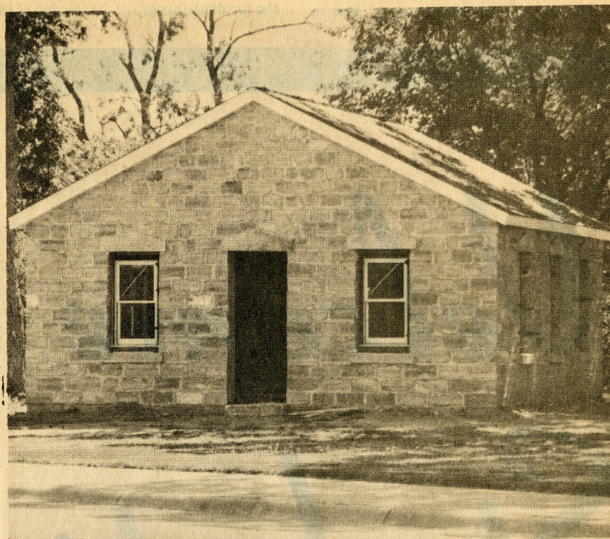
Replica of one-room schoolhouse is nearly completed.

Dedication of the new Rarick Hall will have to wait a few years. The classroom building is scheduled for completion in the spring of 1981. The building, now under construction, will be located on the northeast part of the campus next to Martin Allen Hall.