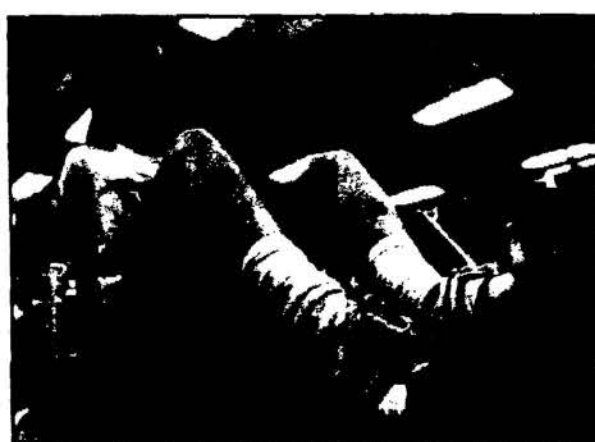
Julie wears shoes specially designed for weightlifting. "The shoes help to keep your heels on the ground. You're supposed to push from your heels — it is where the power comes from."

She began in January. "I started out in spring