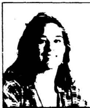
Colen Schroeder STAFF WRITER

last me a lifetime. Where else can a person get roped at a party? But, I digress.