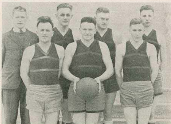
The 1919 Fort Hays State basketball team

After the college was admitted to the Kansas Conference in 1914, men's athletic teams competed on a par with other Kansas colleges. In 1917 the football team won the school's first ath-