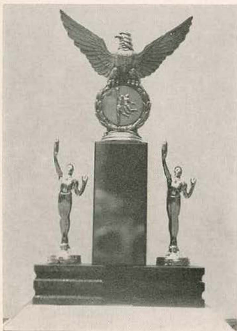
The Tigers' 1961-62 CIC trophy