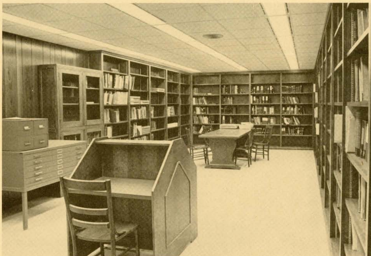
Ethnic Studies Room