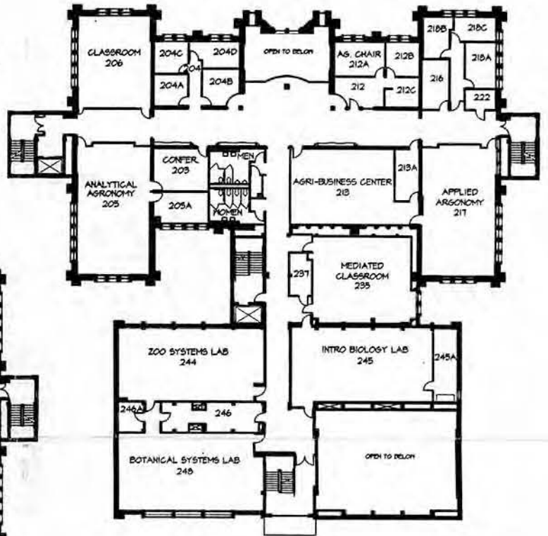
ALBERTSON HALL - SECOND FLOOR PLAN NOT TO SCALE AUGUST 2000