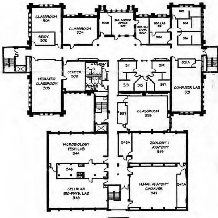
ALBERTSON HALL - THIRD FLOOR PLAN NOT TO SCALE AUGUST 2000