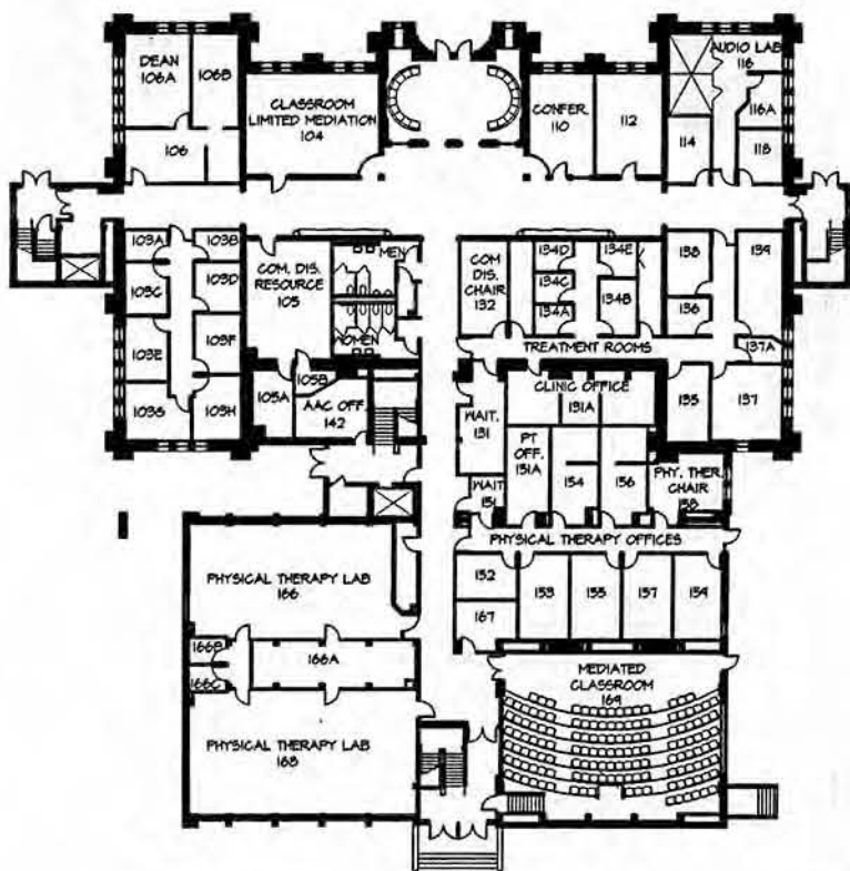
ALBERTSON HALL - FIRST FLOOR PLAN NOT TO SCALE AUGUST 2000