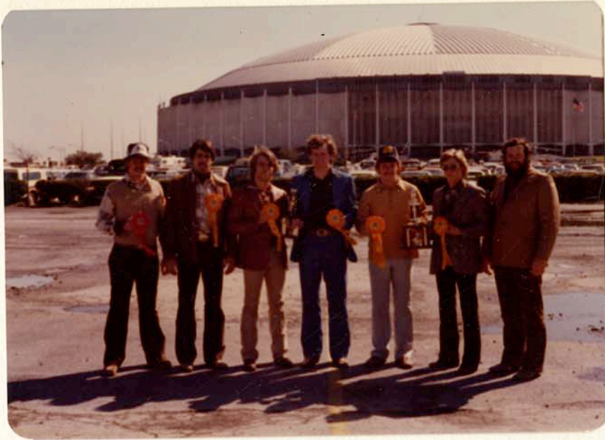
Horse Judging Team