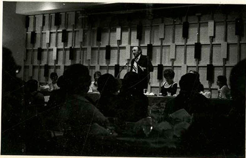
Block & Bridle Banquet 1979