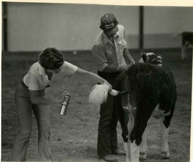
Getting ready for Little International