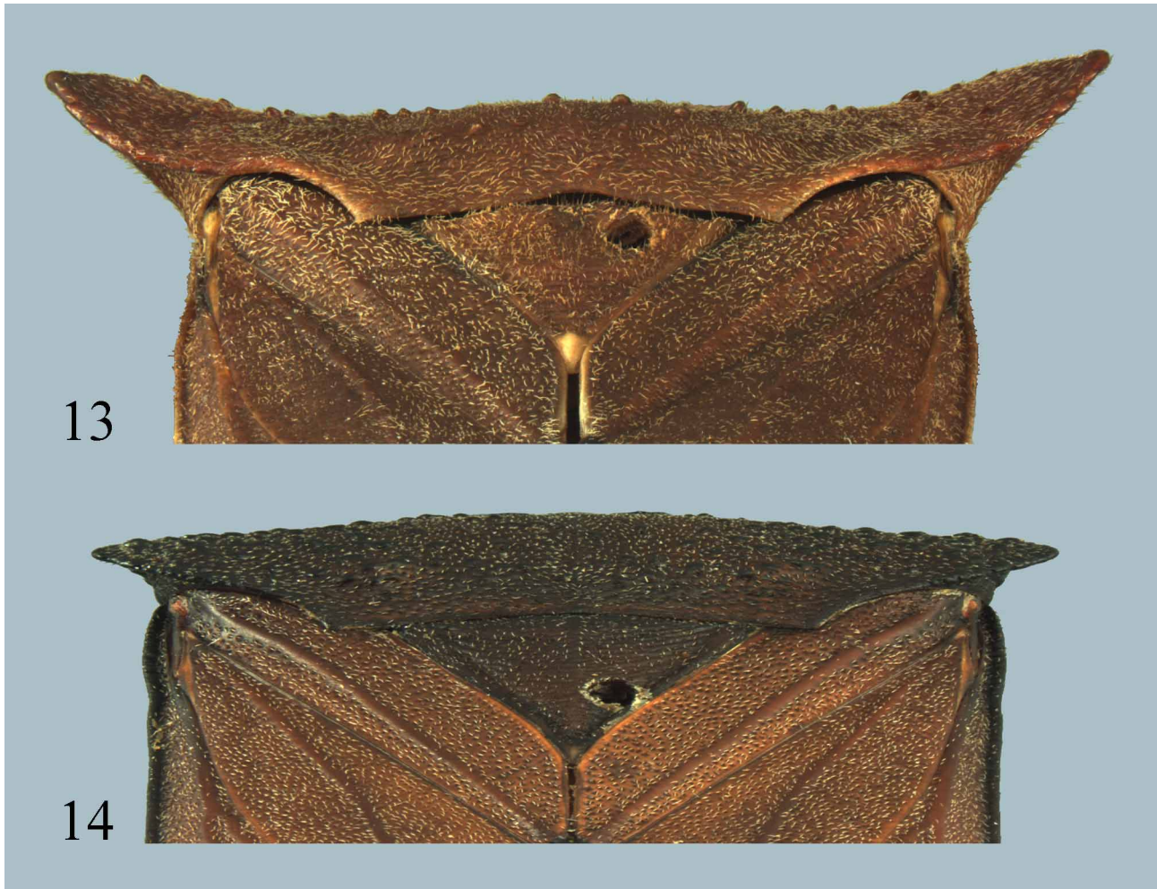
FIGURES 13–14. Humeral angles of Acanthocephala , posterior view. 13. A. declivis . 14. A. thomasi .

PLM (unpublished data) provides the following information: This species was found with A. terminalis on Celtis laevigata Willdenow (sugarberry) (1978) in "mixed sex aggregations with adults observed feeding on sap through the bark" on 29 March (PLM/TPF). It also was found on Baccharis neglecta (1976) (4 adults, February–March, November) from the same locality, but no nymphs or feeding was observed.